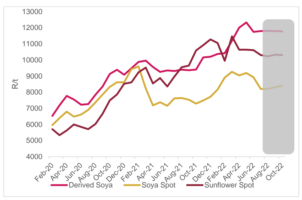
Figure 3: SAFEX oilseed price projections

We expect soybeans to trade around R8 300 per ton with an upside price risk presented by the potential yield losses in the US should bad weather persists in the coming weeks. For sunflower seeds, prices are expected to trade sideways around the R10 000 per ton mark.